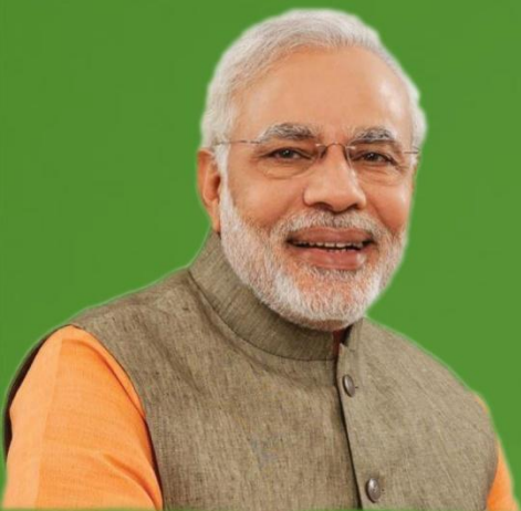
Shri Narendra Modi Hon'ble Prime Minister