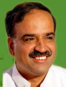
Shri Ananth Kumar Hon'ble Minister (C&F)