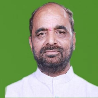
Shri Hansraj Gangaram Ahir Hon'ble Minister of State (C&F)

MOVING AHEAD AND MANY MILES TO GO.... UNDER THE INSPIRING LEADERSHIP OF HON'BLE PRIME MINISTER SHRI NARENDRA MODI